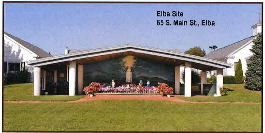
Elba Site 65 S. Main St., Elba