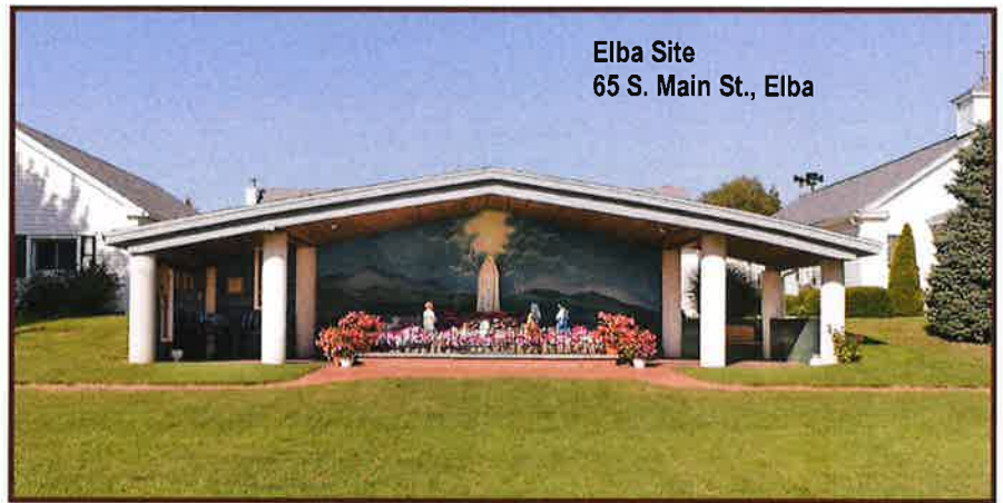
Elba Site 65 S. Main St., Elba