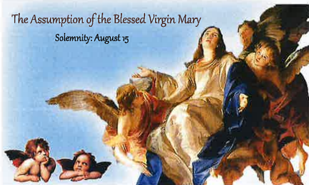
The Assumption of the Blessed Virgin Mary Solemnity: August 15

The Holyday of Obligation will be celebrated (Vigil Mass)-Monday, August 14th in Elba Tuesday, August 15th at: 8AM Mass in Elba 7PM Mass in Oakfield