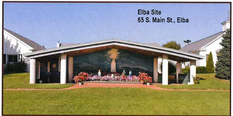
Elba Site 65 S. Main St., Elba