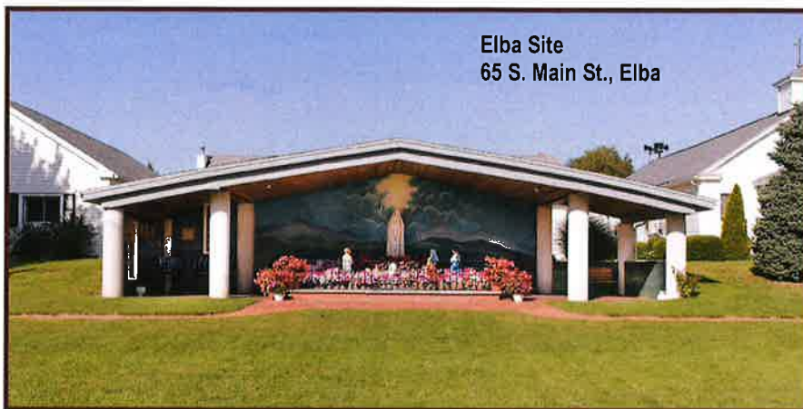
Elba Site 65 S. Main St., Elba