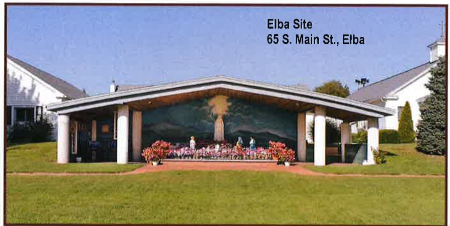
Elba Site 65 S. Main St., Elba