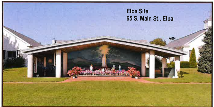
Elba Site 65 S. Main St., Elba

January 8, 2023 The Epiphany of The Lord