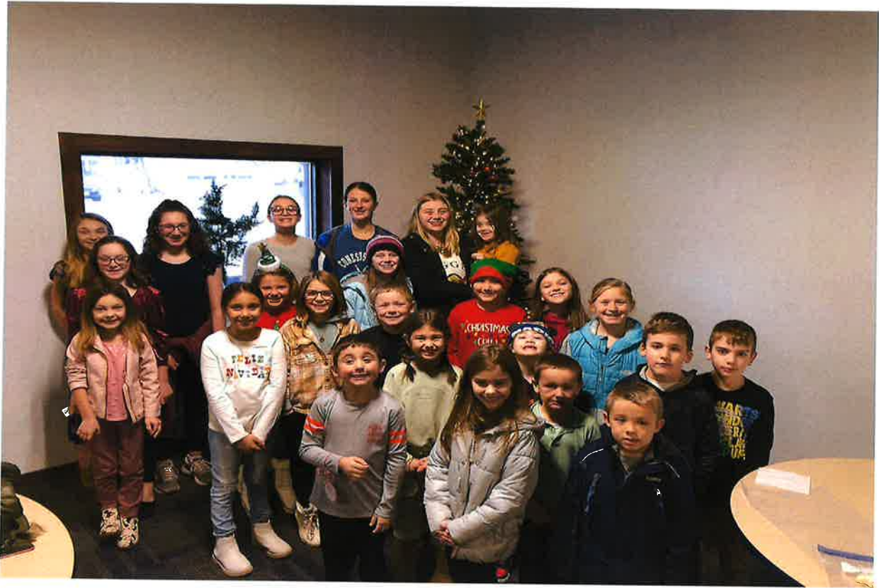
Learned the meaning of giving to others.