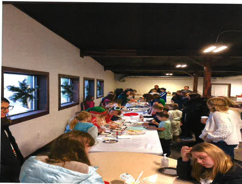
Enjoyed family gathering for special advent activities