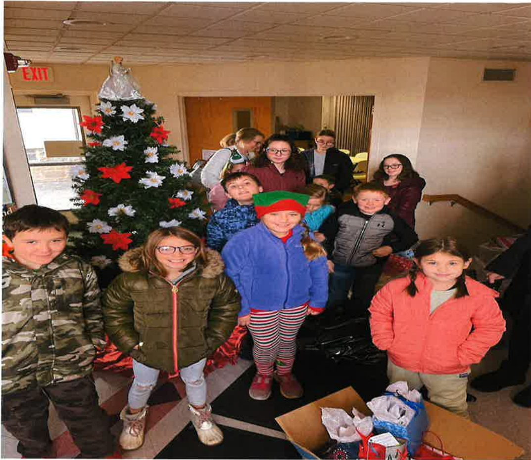
Students and Parents help deliver Christmas gifts to the GOOSE for Service Project