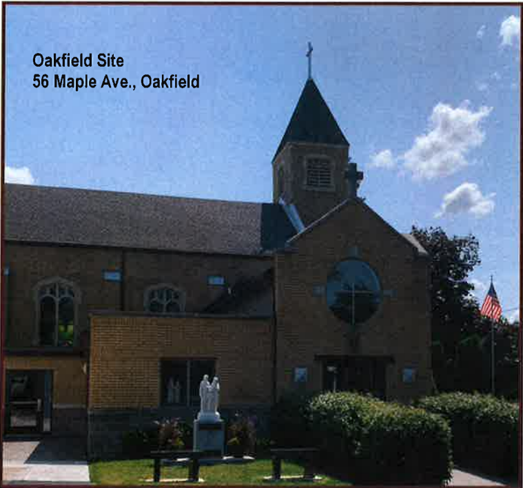
Oakfield Site 56 Maple Ave., Oakfield