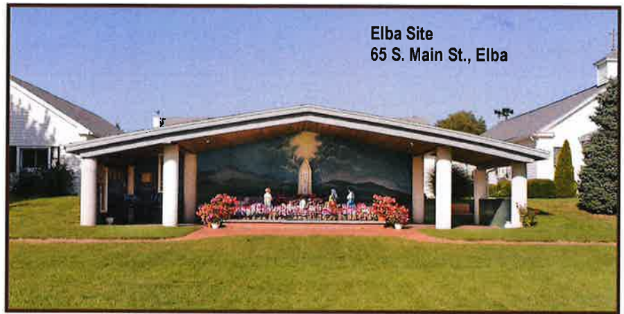
Elba Site 65 S. Main St., Elba