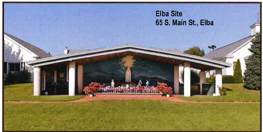
Elba Site 65 S. Main St., Elba