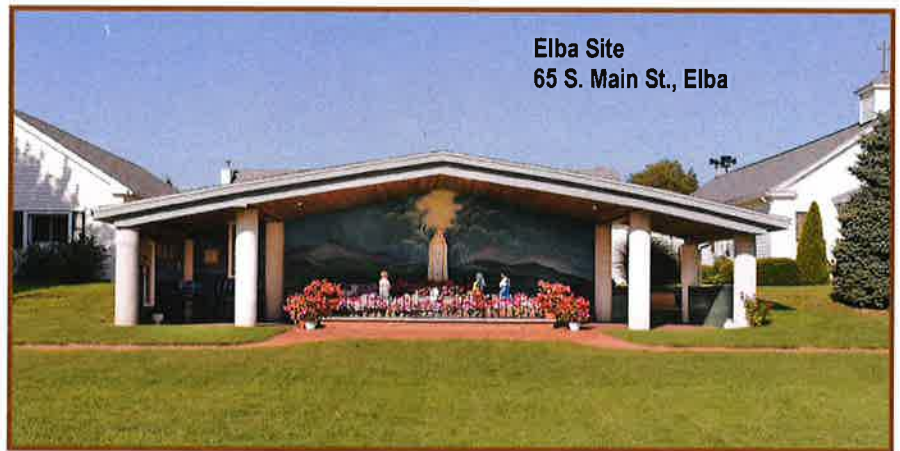
Elba Site 65 S. Main St., Elba

November 28, 2021 First Sunday of Advent