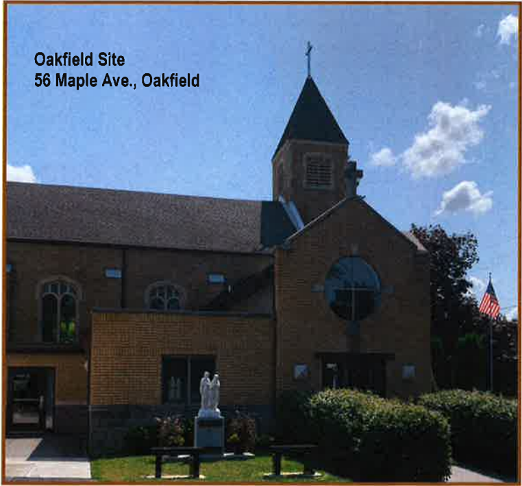
Oakfield Site 56 Maple Ave., Oakfield