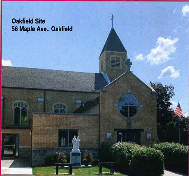
Oakfield Site 56 Maple Ave., Oakfield