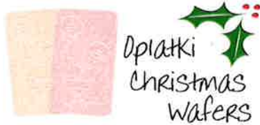
Wafers are available $2/envelope

Need a place to pray during Advent and the Christmas season? The Elba site will be open on Mondays noon to 6:30pm And Fridays from 4 to 8.