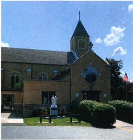
Oakfield Site 56 Maple Ave., Oakfield