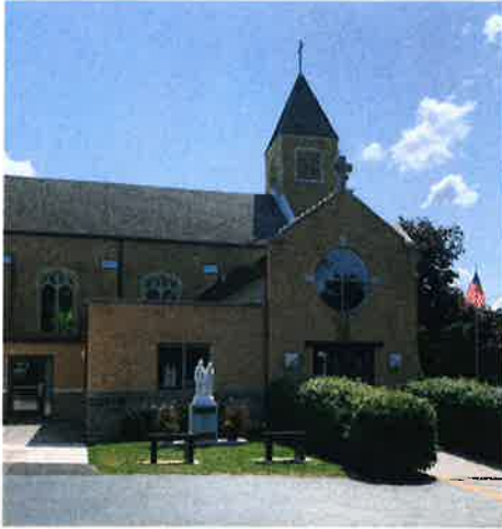
Oakfield Site 56 Maple Ave., Oakfield