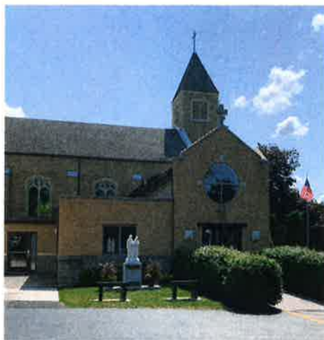
Oakfield Site 56 Maple Ave., Oakfield