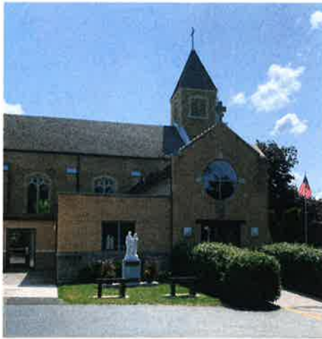
Oakfield Site 56 Maple Ave., Oakfield