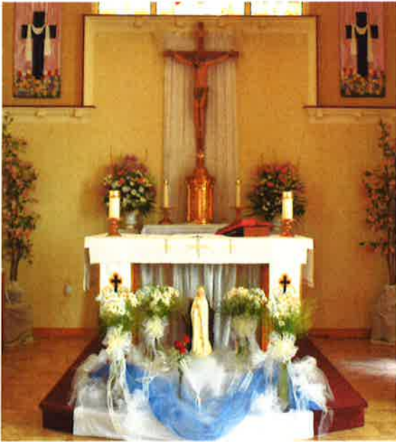
Oakfield Site 56 Maple Ave., Oakfield