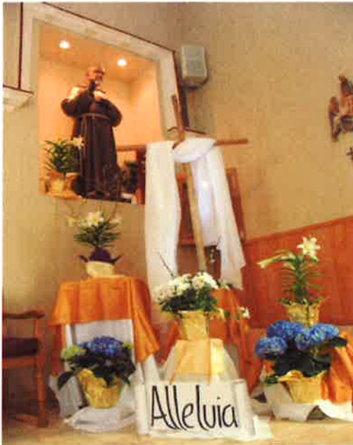
Oakfield Site 56 Maple Ave., Oakfield