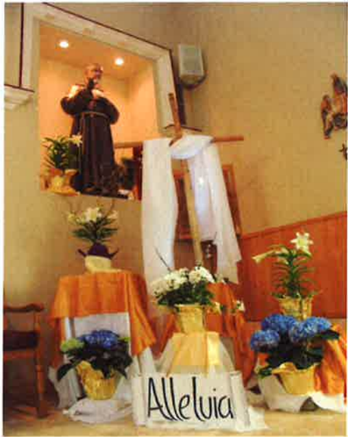
Oakfield Site 56 Maple Ave., Oakfield