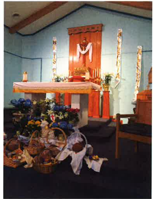
Elba Site 65 S. Main St., Elba