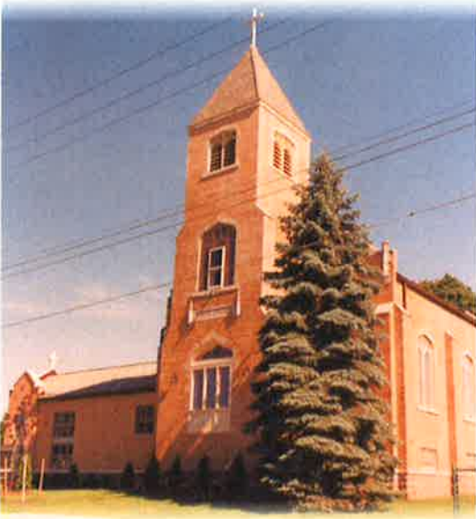
Oakfield Site 56 Maple Ave., Oakfield