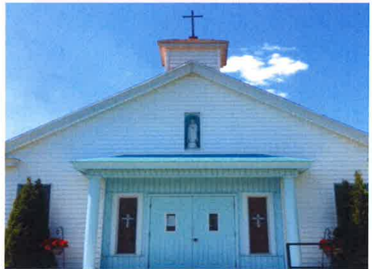
Our Lady of Fatima Worship Site 65 S. Main St. Elba NY 14058