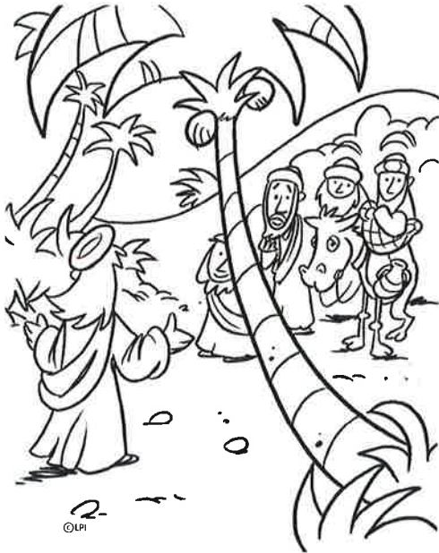
"Whoever does not carry his own cross and come after me cannot be my disciple."