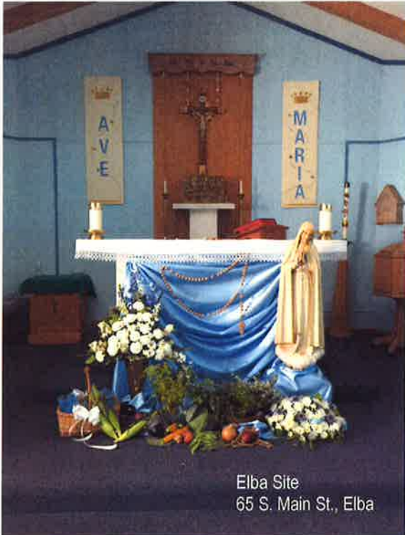
Elba Site 65 S. Main St., Elba