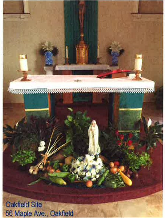
Oakfield Site 56 Maple Ave., Oakfield