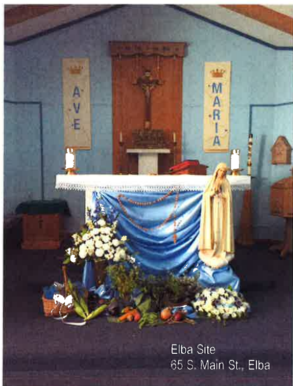
Elba Site 65 S. Main St., Elba