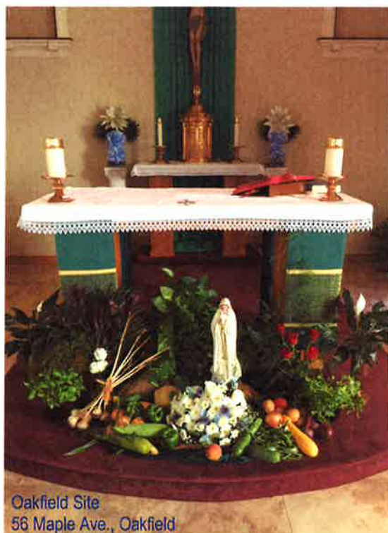
Oakfield Site 56 Maple Ave., Oakfield