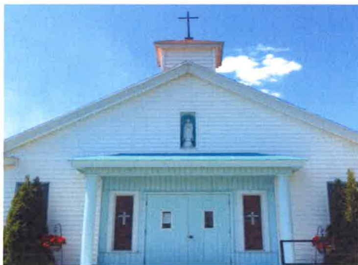
Our Lady of Fatima Worship Site 65 S. Main St. Elba NY 14058