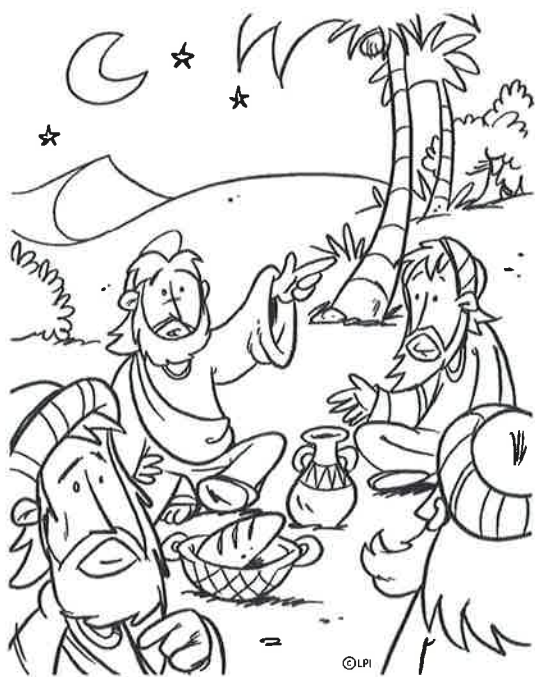
"They can no longer die, for they are like angels; and they are the children of God because they are the ones who will rise."

COPYRIGHT 2016 CATHOLICMOM.COM IMAGE © LITURGICAL PUBLICATIONS USED WITH PERMISSION