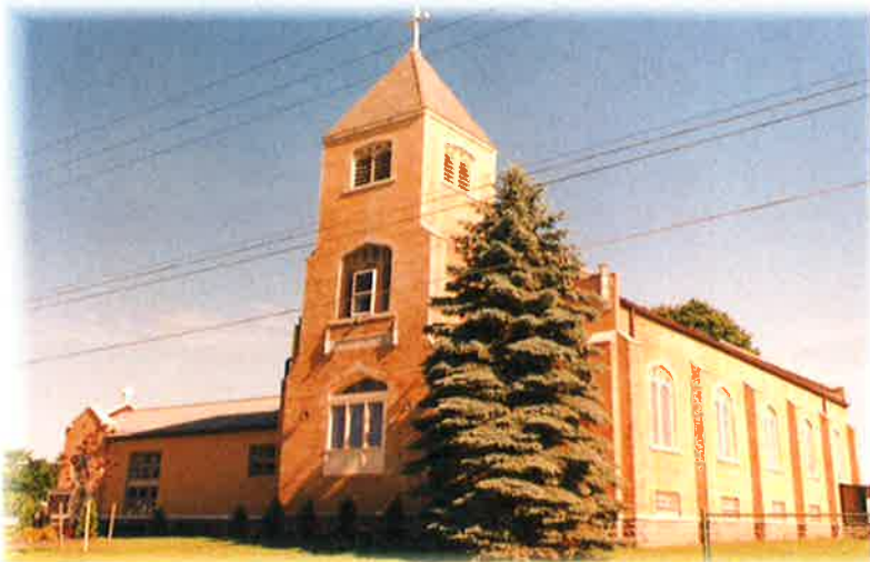
St. Cecilia Worship Site 56 Maple Ave. Oakfield NY 14125