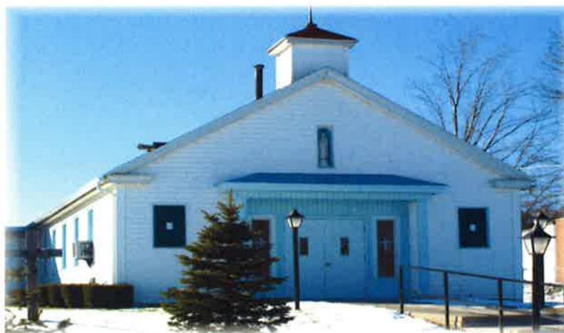
Our Lady of Fatima Worship Site 65 S. Main St. Elba NY 14058

Priesthood/Religious life: If you hear God's calling to serve him as a priest, deacon or to live a consecrated life, contact the Vocations office in the Diocese of Buffalo at 716-847-5535.